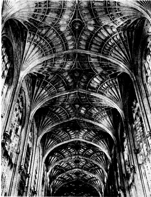
FIGURE 2. The ceiling of King's College Chapel.

the Tudor rose and portcullis. In a sense, this design represents an 'adaptation', but the architectural constraint is clearly primary. The spaces arise as a necessary by-product of fan vaulting; their appropriate use is a secondary effect. Anyone who tried to argue that the structure exists because the alternation of rose and portcullis makes so much sense in a Tudor chapel would be inviting the same ridicule that Voltaire heaped on Dr Pangloss: 'Things cannot be other than they