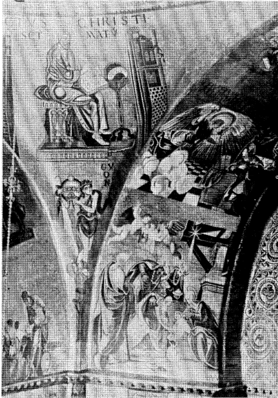
FIGURE 1. One of the four spandrels of St Mark's; seated evangelist above, personification of river below.

The design is so elaborate, harmonious and purposeful that we are tempted to view it as the starting point of any analysis, as the cause in some sense of the surrounding architecture. But this would invert the proper path of analysis. The