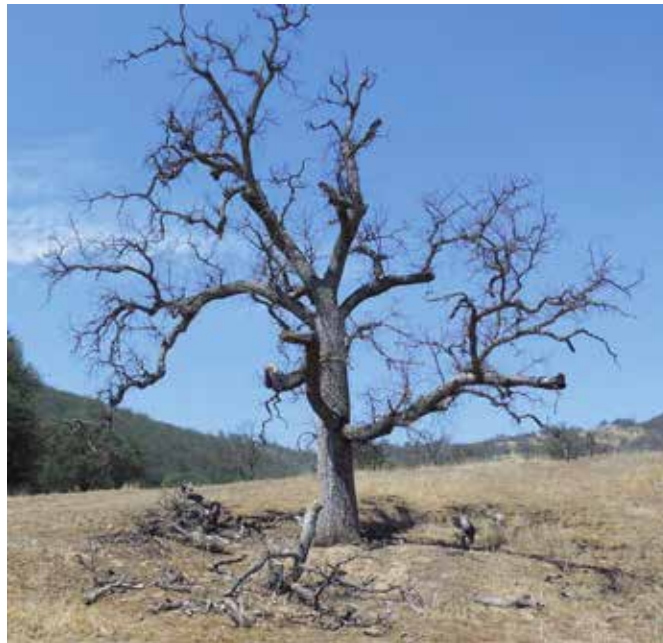
Valley oak ( Quercus lobata ) from central coastal California, one of the 70 trees that died of natural causes studied to test whether oaks invest more in producing acorns than expected in the years before their demise.